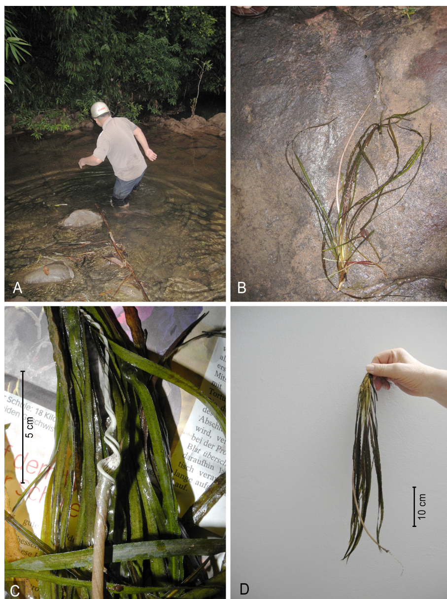
Fig. 2. Cryptocoryne crispatula var. tonkinensis – A: pool shown in Fig. 1C with large patch of submerged plants being sampled; B: extracted plant lying beside pool; C: spathe showing spirally coiled limb with purple line-like markings; D: sampled plant showing long flaccid leaves and long spathe exceeding leaves in length. – Photographed on 15 Dec 2013 by M. Ørgaard.

The original description of Cryptocoryne tonkinensis by Gagnepain (1941) is based on three herbarium gatherings from Vietnam: “Rive droite de la rivière Noire, en aval de Ben-heu”, 29 Nov 1887, Balansa 2043 (L0041882, L0041883, P00461144, P00461145, P00461146, P00461147); “Vallée de Baa-tai, à la base du Mont Bavi” [present-day Mt Ba Vi], 8 Feb 1887, Balansa 2044 (L0041884, L0041885, P00461140, P00461141, P00461142, P00461143); and “Vallée de Baa-tai (Mont-Bavi)”, Aug 1887, Balansa 2045 (P00509483). The specimens in L can be seen at http://vstbol.leidenuniv.nl/NHN/Explore and those in P can be seen at https://science.mnhn.fr/institution/mnhn/collection/p/item/search/form .