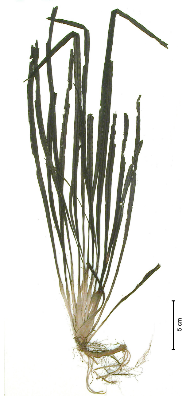
Fig. 3. Cryptocoryne crispata var. tonkinensis – China, Guangxi Province, tributary of Beilun River near village of Na Liang, H. Zhou 05-04-3 (L). – Photograph by J. D. Bastmeijer.

Zhou & al. (2010) also found another form of Cryptocoryne crispata with long narrow undulate-crispate leaves occurring in a small stream north of Dongxing, also in Guangxi Province, which was then also referred to var. flaccidifolia . Based on our present observations we would now also refer this gathering to var. tonkinensis (Na Suo River, 30 Jan 2010, H. Zhou ZH2010-2 [= B 1353],