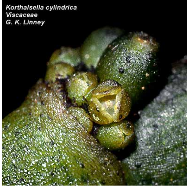
Seeds of Korthal mistletoes are ejected explosively into the environment.