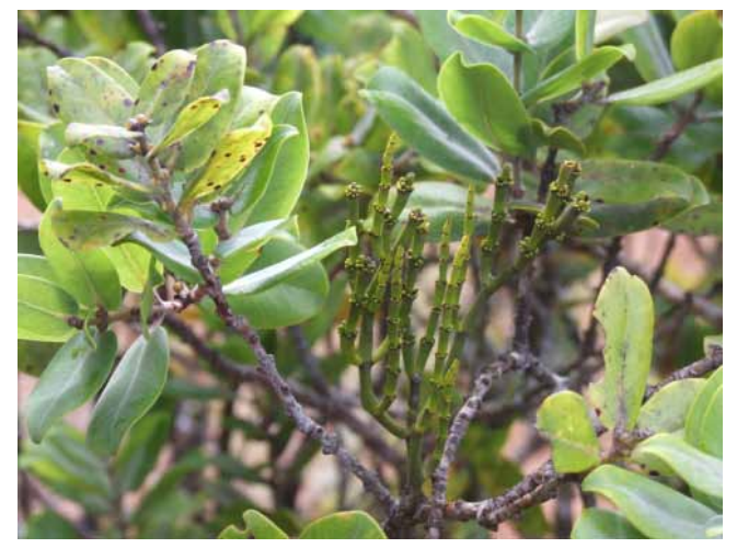
Korthalsella remyana infecting a branch of Metrosideros polymorpha at Alakai Swamp, Kōke'e, Kaua'i