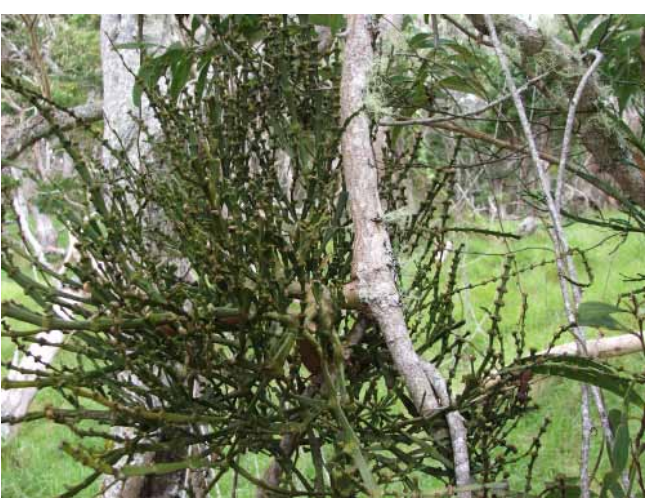
A vigorous Korthalsella complanata plant infecting Acacia koa near Keanakolu on the island of Hawai'i