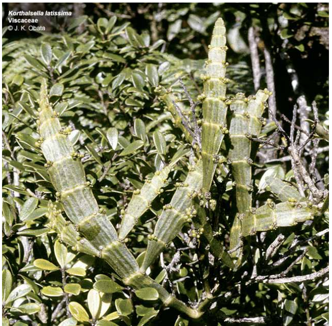
The flattened stems of this specimen of K. latissima are wider than and do not narrow as appreciably at the nodes as the stems of K. complanata above.