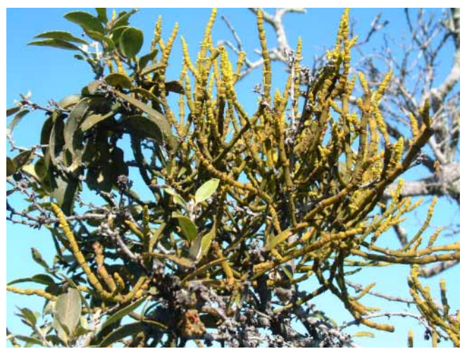
Korthalsella remyana infecting a branch of lama ( Diospyros sandwicensis) at Kaupulehu on Hawai'i