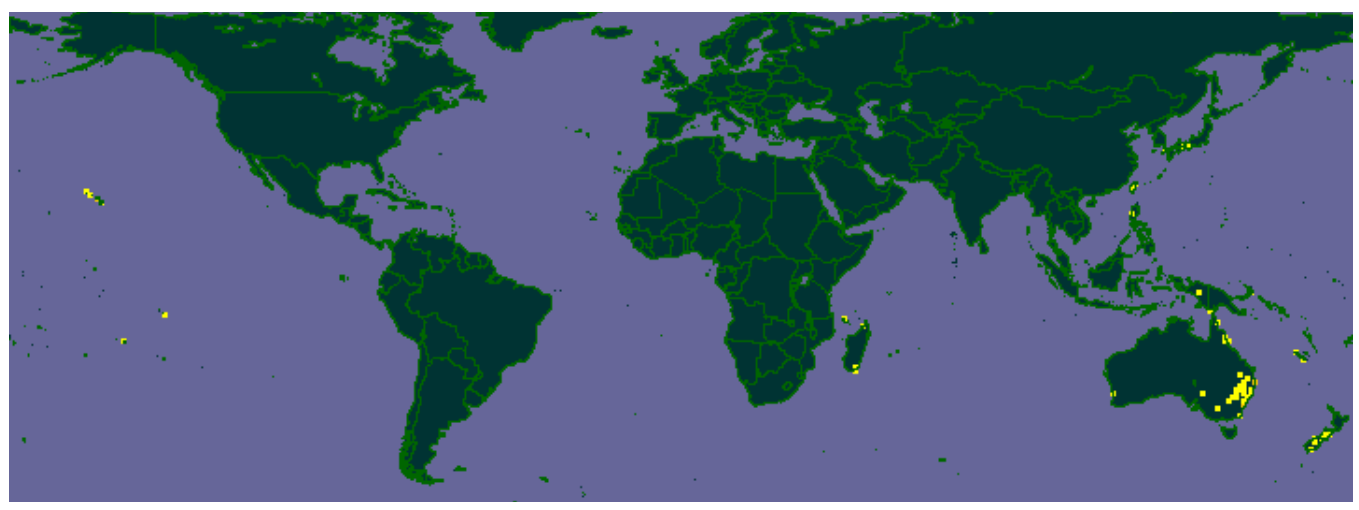
Worldwide distribution of Korthalsella (Global Biodiversity Information Facility Network)

globose in mature bud; perianth lobes 3. Anthers sessile, circular, 2-loculed, introrse, connate into a synandrium, dehiscence longitudinal. Pollen grains prolate, semicircular in polar view. Female flower ovoid in mature bud; perianth lobes 3, minute. Placentation free, central. Style absent; stigma nipple shaped. Berry elipsoid or pyriform, mostly less than 4 mm, crowned by persistent perianth, exocarp smooth, weakly explosive at maturity." There are about 25 species in tropical and subtropical temperate regions of the Old World (except Europe), and one species in China (Hua-Shing 1988).