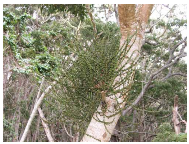
A large Korthalsella complanata plant infecting a young Acacia koa tree near Keanakolu on the island of Hawai'i