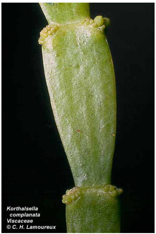
A stem of K. complanata ; members of this species are somewhat variable in morphology, in this case the flattened stem tends to narrow appreciably at the nodes.