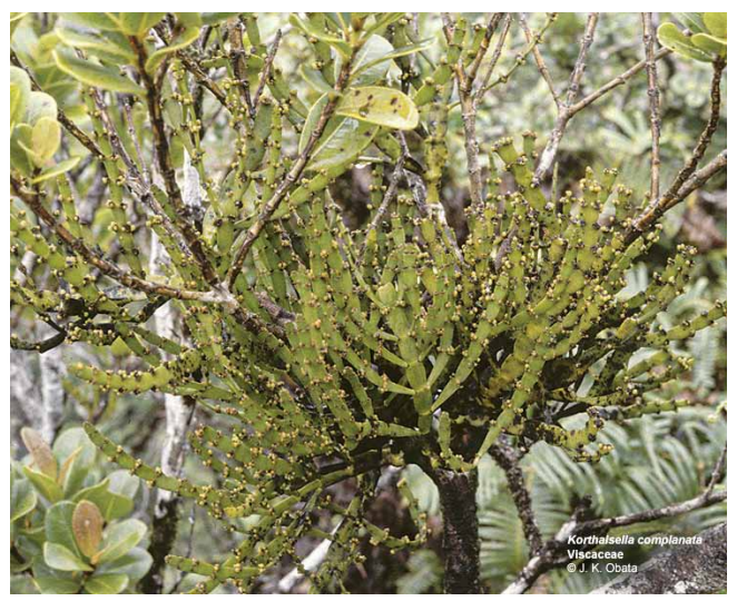
Korthalsella complanata infecting Metrosideros polymorpha