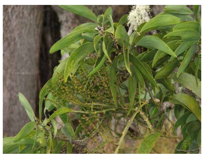
A Korthalsella complanata plant infecting Acacia koa near Keanakolu on the island of Hawai'i