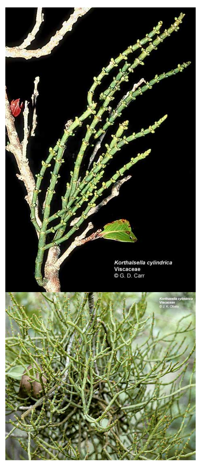
Typical specimens of K. cylindrica on Hawaiian hardwoods. This species is characterized by distichous branching, with branches in same plane.