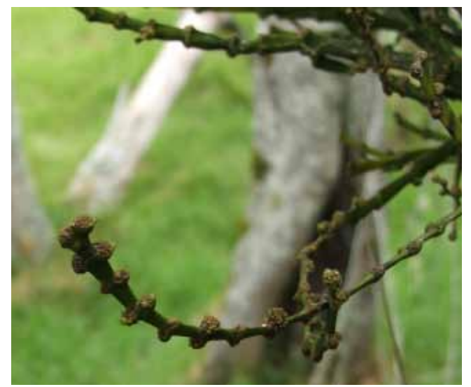
Close-up of a branch of Korthalsella complanata