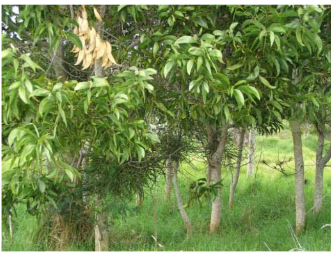
A population of Korthalsella complanata infecting a young stand of Acacia koa near Umikoa, on the island of Hawai'i