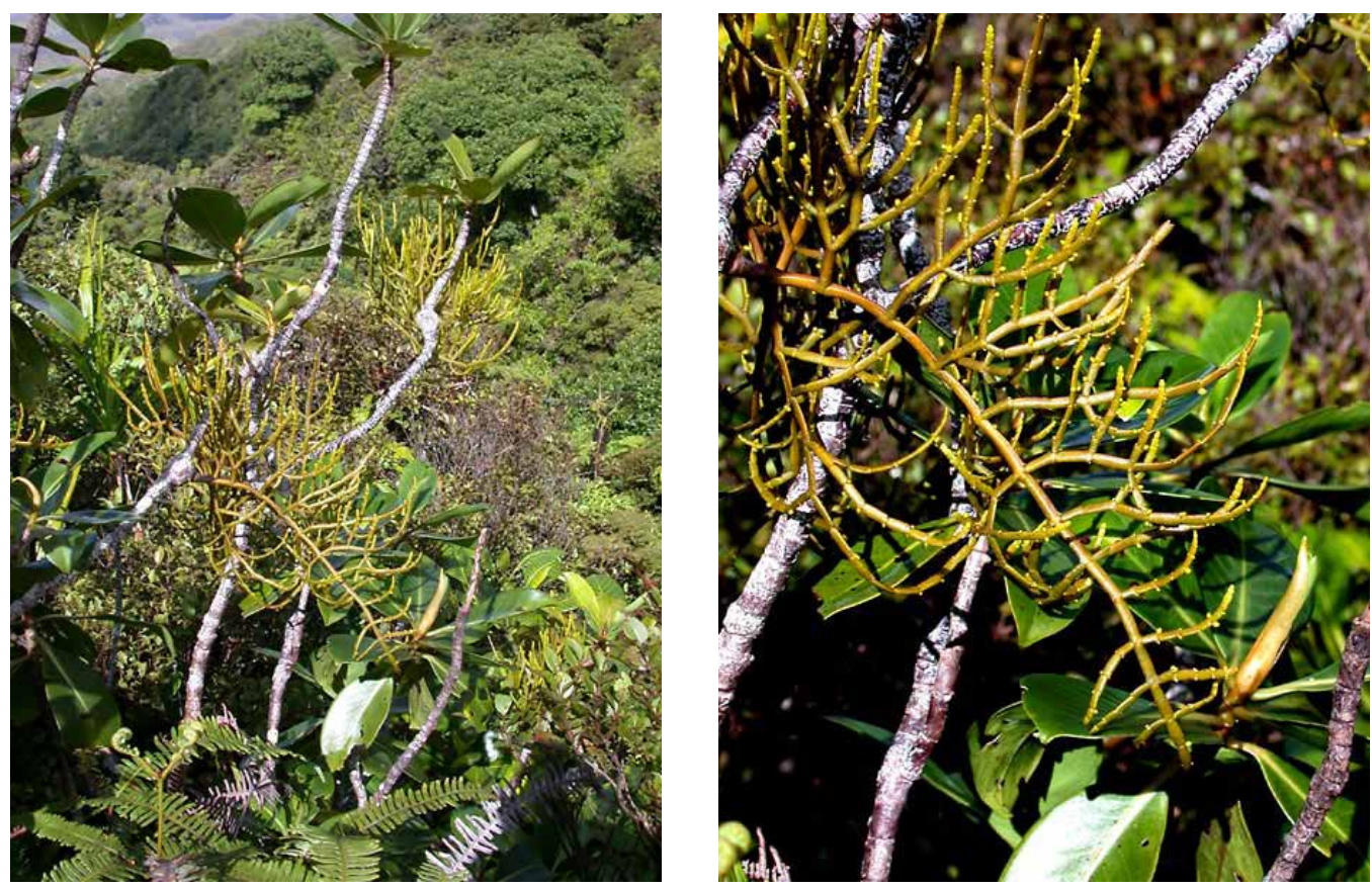
Korthalsella platycaula, French Polynesia, Marquesas islands.