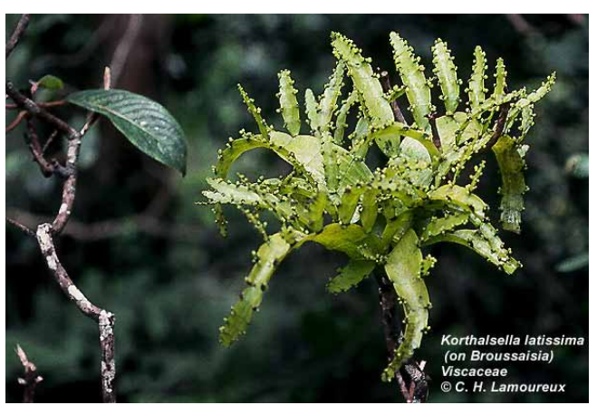
Korthalsella latissima, as the name implies, has wider internodes than the other species, and the stem does not narrow as appreciably at the internodes as stems of K. complanata.