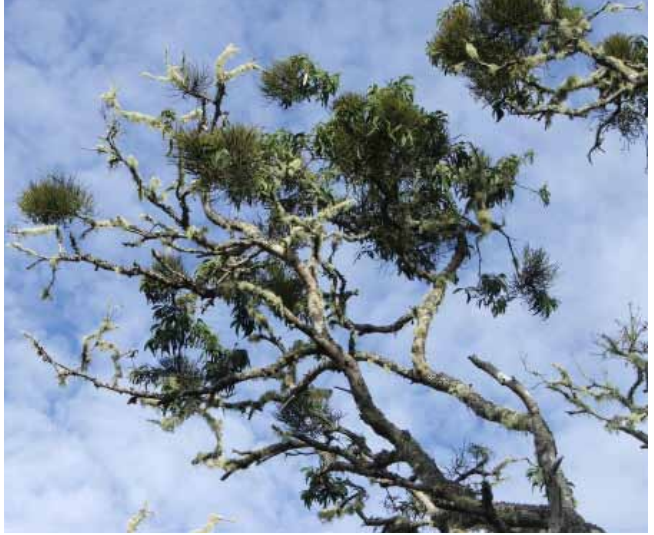
Korthalsella complanata plants dominating the canopy of an old, declining Acacia koa tree near Keanakolu on the island of Hawai'i