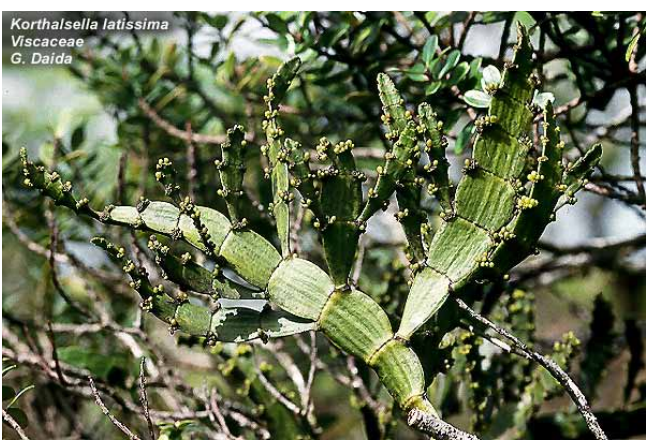
Flattened stems and reduced leaves make K. latissima resemble an aerial cactus.