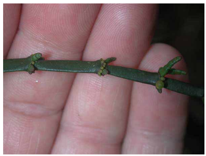
Close-up of flowering stem of Korthalsella platycaula from O'ahu.